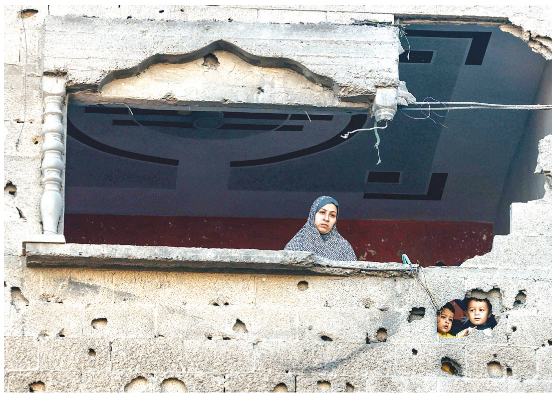
RAFAH: A Palestinian woman and children look on following Israeli bombardment on Rafah, in the southern Gaza Strip, on Friday, amid continuing battles between Israel and the Palestinian militant group Hamas.

Visitors to the weeklong "Development Fair" expressed deep appreciation for the opportunity to learn about Bangladesh's outstanding development stories and trade and investment opportunities. They expressed a desire for deeper and wider business and economic relations between Bangladesh and Pakistan. The fair served as a platform for fostering mutual understanding and strengthening bilateral ties between the two nations.