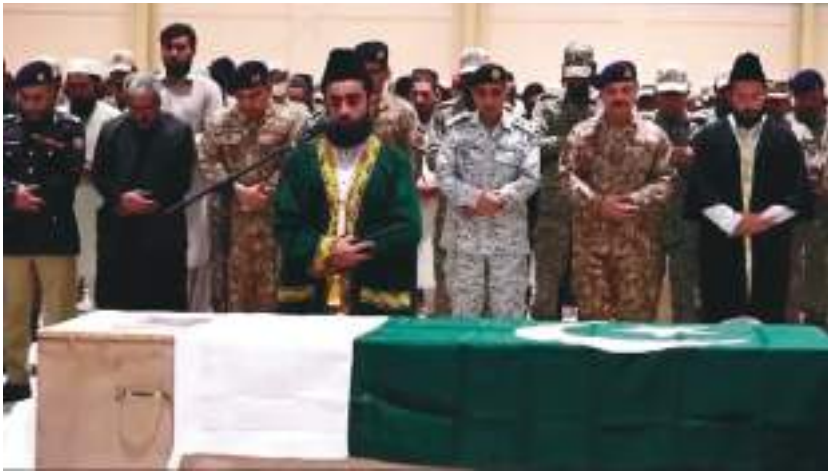
GWADAR: Funeral prayers being offered of the soldier martyred in Gwadar on Thursday.

"Rohingya refugees have reported that despite the considerable risks associated with this sea route, they undertake these dangerous boat journeys due to the challenges of living in protracted displacement, the limited prospects for solutions, and the current situation in Myanmar," it said.