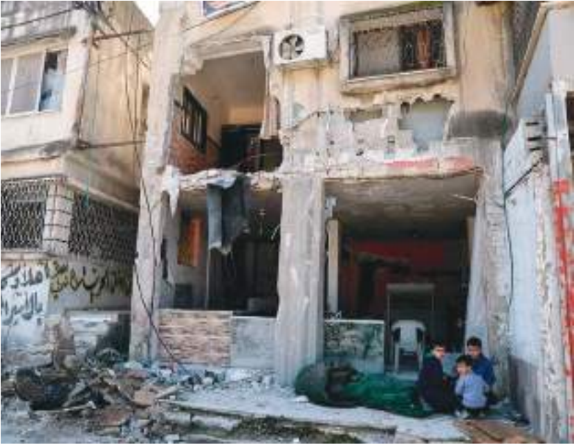
WEST BANK: Children sit near rubble, in the aftermath of an Israeli raid, at Nour Shams camp, in Tulkarm, in the Israeli-occupied West Bank March 21, 2024.

NEW DELHI: New Delhi's Chief Minister Arvind Kejriwal has been arrested. According to Indian media reports, Kejriwal is accused of corruption in the liquor policy. According to Aam Aadmi Party leader Atishi, Arvind Kejriwal was arrested on Thursday in a liquor policy case. The Enforcement Directorate (ED) team visited Arvind Kejriwal's residence today in connection with the liquor policy case. The Enforcement Directorate team also seized 4 or 5 mobile phones and 2 tablets from the Chief Minister's residence.