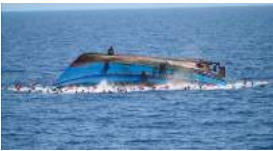
MEULABOH, INDONESIA: Victims were found about 21 miles from the busy Ujung Karang Harbor, Meulaboh, Indonesia, here on Thursday.

The fine is linked to a copyright dispute in France over online content in a case triggered by complaints from some of the country's biggest news organizations, including Agence France Presse.