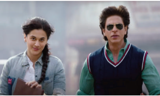
NEW DEHLI: Bollywood King Shah Rukh Khan along with a co actor posed for a recently released movie, here on Monday.

NEW DEHLI: As the curtains draw on 2023, Bollywood is celebrating a stellar year at the box office, with a parade of blockbusters captivating audiences and setting cash registers ringing. Theaters across India are witnessing full houses, marking a triumphant return to the cinematic experience. Bollywood filmmakers unleashed a diverse array of emotions, action-packed sequences, and gripping drama onto the silver screen. From the thunderous success of “Tiger 3” to the adrenaline-pumping narrative of “Jawan” and the spine-chilling suspense of