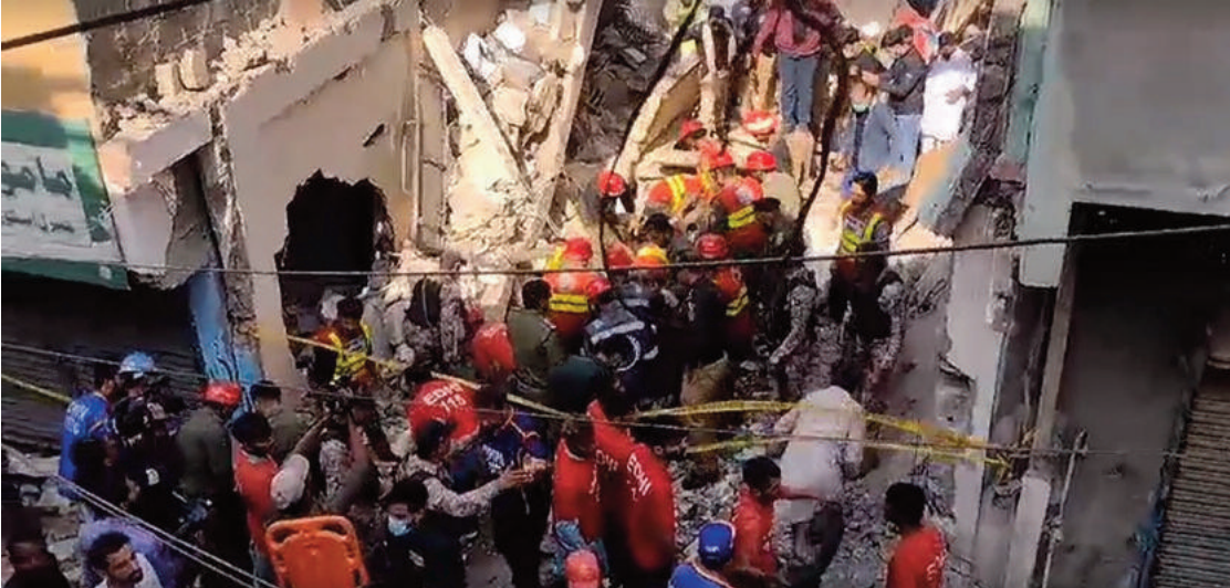
KARACHI: Volunteers busy in rescue works after the building was collapsed due to gas cylinder explosion in Machar Colony area of Karachi, here on Monday.