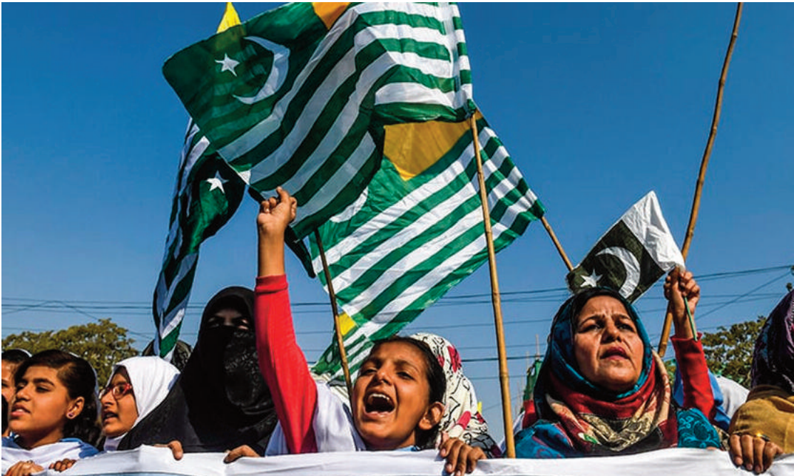
MUZAFFARABAD: Kashmiris protesting against the decision of Indian Supreme Court over Article 370 terming the betrayal of their identity, here on Monday.