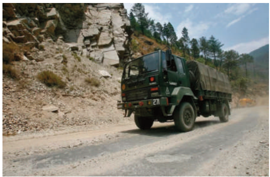
An Indian army truck drives along Tezpur-Tawang highway in Arunachal Pradesh, India.

Modi inaugurated a road tunnel in Arunachal Pradesh. Zhang said in a statement that India should "stop taking any moves that complicate the border issue and