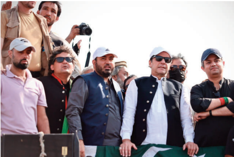
ISLAMABAD: Pakistan Tehreek-e-Insaf (PTI) Chairperson Imran Khan surrounded by party leaders during the 'Haqeeqi Azadi' march.

Furthermore, the BLP includes plans for constructing 150 parking stands to accommodate e-bikes, allowing citizens to access affordable bike rental services. This initiative aligns with the phased elimination of petrol-powered bikes, contributing to a cleaner and healthier urban environment. The project encompasses essential features such as lighting and security arrangements to ensure a safe cycling experience for all users.